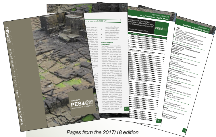
Pages from the 2017/18 edition

Maximise your presence and increase business with one of our promotional packages, exclusively available to members of the PESGB.